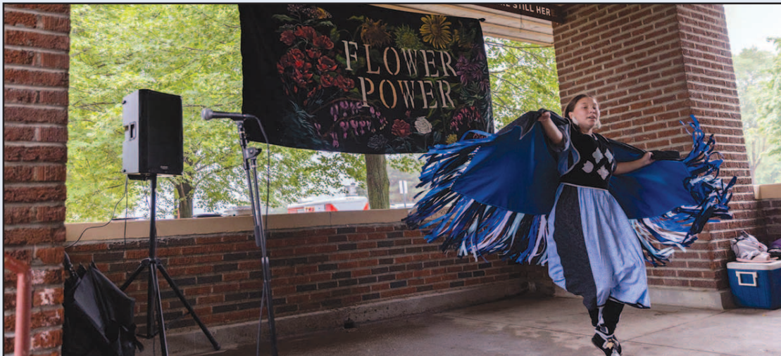
A fancy dancer at an event for the Oyate Hotanin.

BY JAIDA GREY EAGLE AND AMY NELSON PRODUCED IN PARTNERSHIP WITH GREENSPRINGS MEDIA