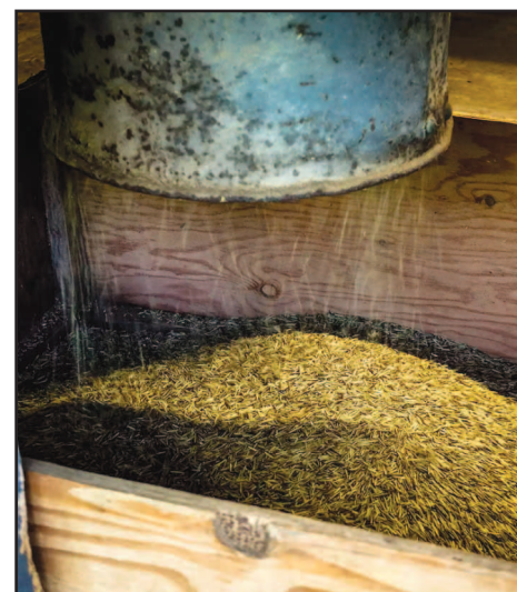
Top: John Beltman tends the fire in preparation for a day of processing recently harvested wild rice.