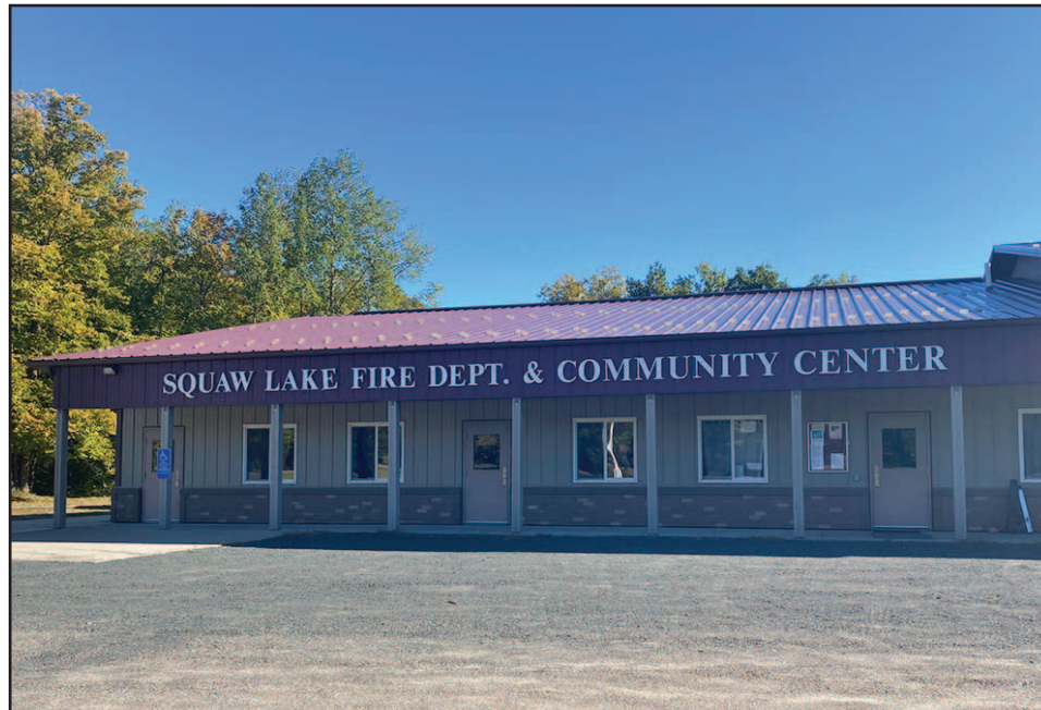
The Fire Department/Community Center named after the town.